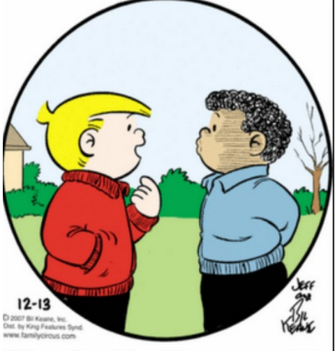
"When I'm older, I'll grow a stubbly beard so girls won't wanna kiss me."