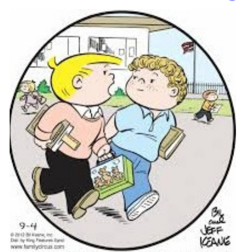
"The hardest part about goin' back to school is getting my voice to whisper again."